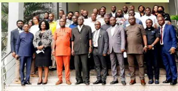
Group photograph from the ongoing South South JTB TIN refresher training taking place at Delta State IRS Training School, Warri.