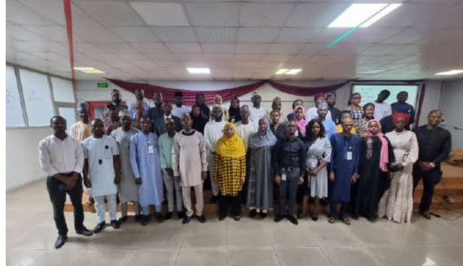
Training of FCT-IRS Officers