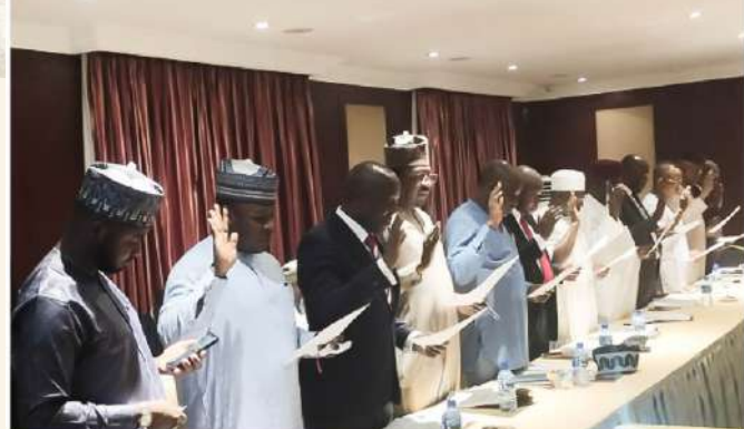
inductees taking oath of allegiance during induction ceremony for members of the JTB