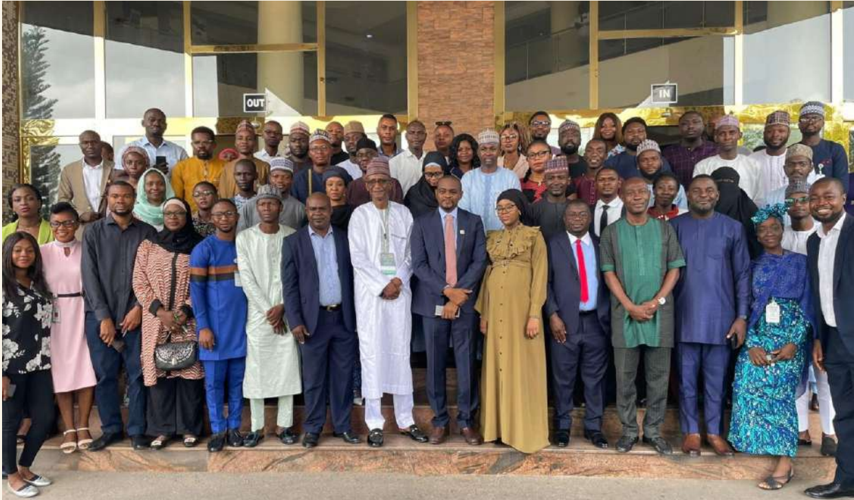
Group photograph of Participants at the North Central JTB TIN Registration System Refresher Course hosted by FCT IRS at Chelsea Hotel, Central Business Area Abuja.