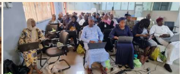
Group picture with Secretary JTB of FCT-IRS Training on JTB TIN Registration System at JTB Conference room.