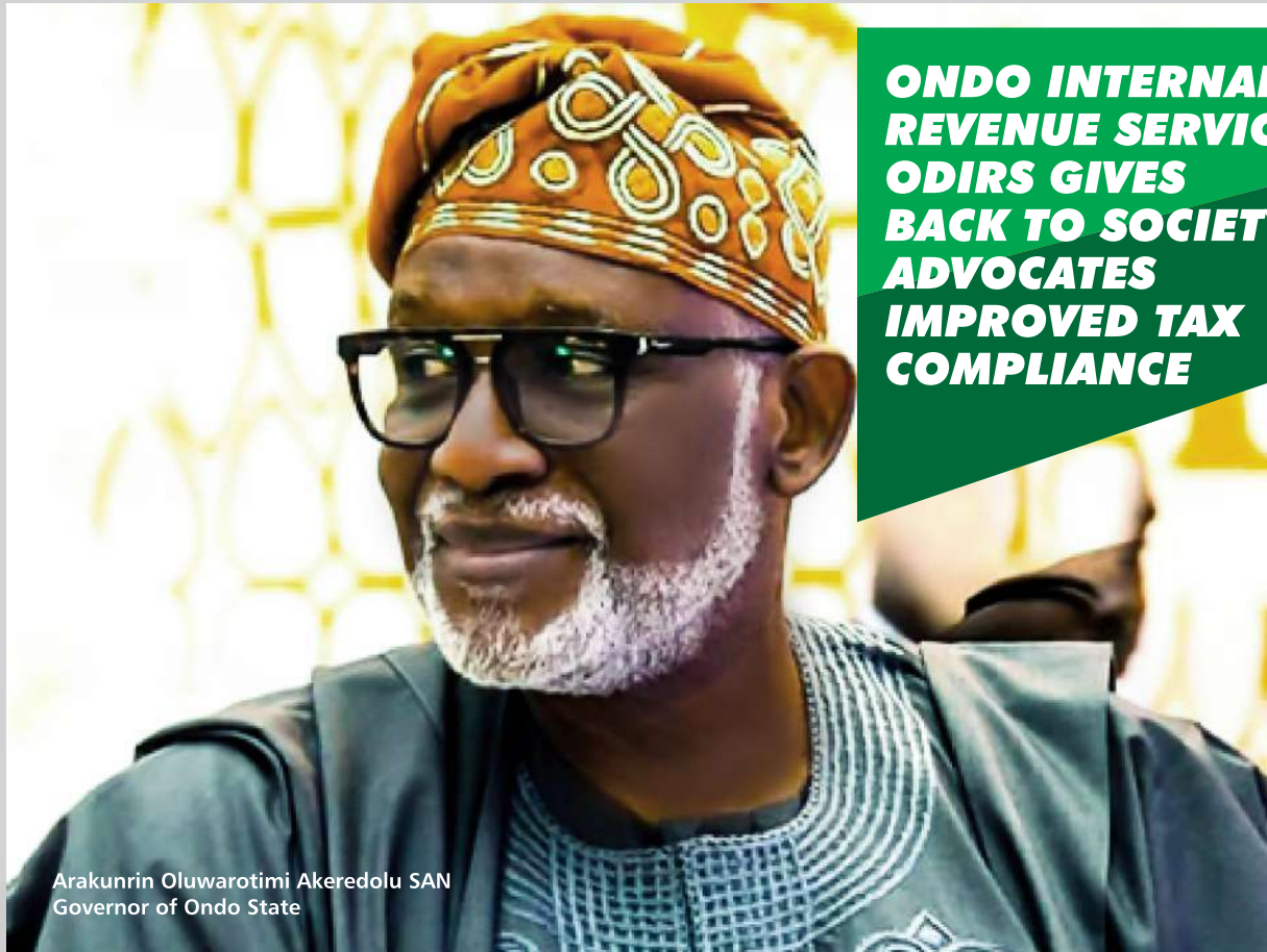
Arakunrin Oluwarotimi Akeredolu SAN Governor of Ondo State