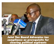
Photo Gallery pg 15-20