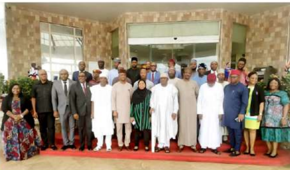
Group photograph of the newly inductees of the JTB members